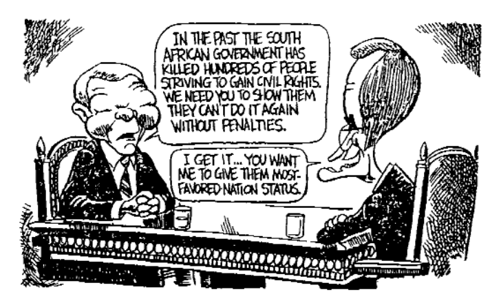
Plante, The Chattanooga Times

I returned from Angola convinced that the biggest changes regarding the disabled community there need to be made in South Africa and here in the US. The US government must stop supporting terrorists who strategically disable individuals, communities, and nations. It is up to the people of the US to bring our government's behavior into line with international law and common human decency.