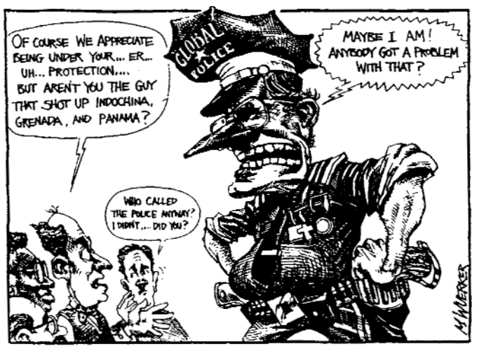
Wuerker, Z Magazine, October 1990

A: I think it's definitely a dangerous period. When you look at the kind of justifications Washington used for the invasion of Manama, it could use those justifications for invading any number of countries that are involved in drug production and trade: Peru, Bolivia, Colombia, a number of Asian countries. A country in the throes of decline - and I think the US really is in the throes of decline - tends to kick and scream a lot.